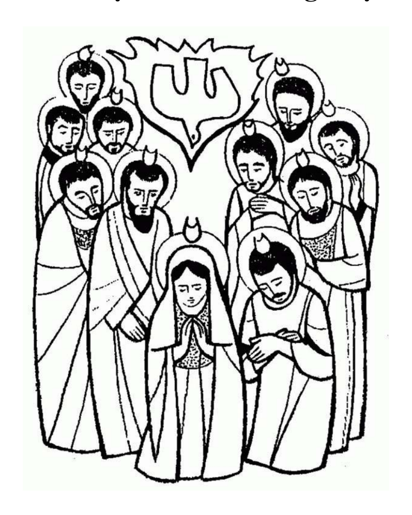
The Fifteenth Week after Pentecost 2024