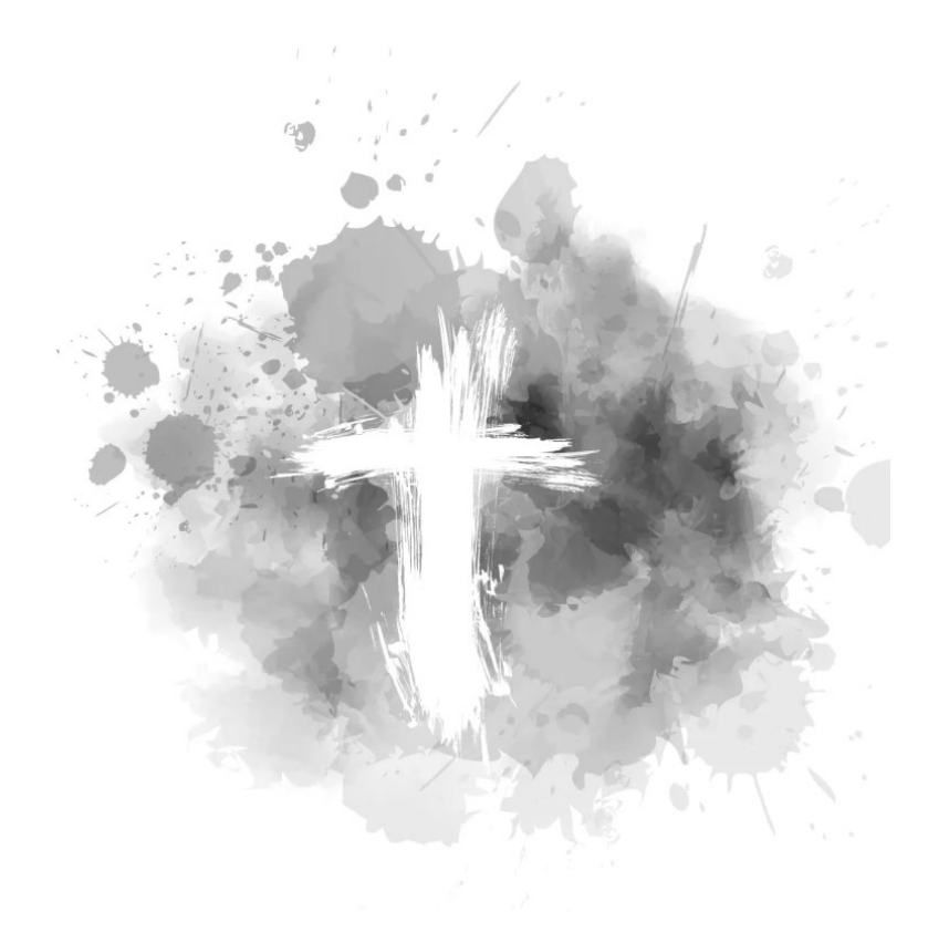
The Last Week after the Epiphany 2025